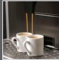
Consistent Shot Delivery