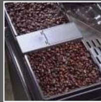
Dual Bean Hoppers