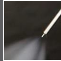
Auto Shut-Off Steam Wand