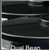
Dual Bean Hoppers