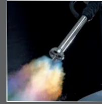
finesteam ® Technology